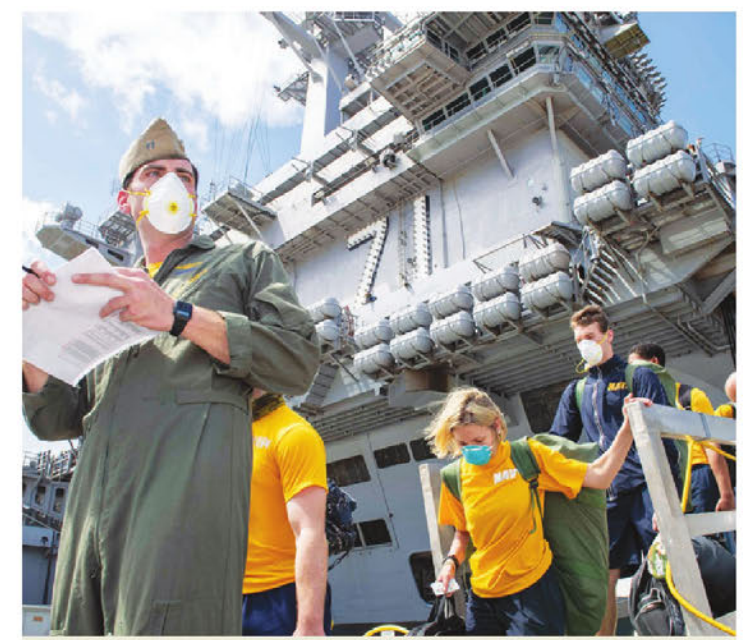
USS THEODORE ROOSEVELT: Sailors assigned to the aircraft carrier USS Theodore Roosevelt depart the ship to move to off-ship berthing on April 10.

"The outbreak investigation included asking volunteers to complete a short survey and provide two specimens for laboratory testing (voluntary blood and nasal swab samples)," the Navy stated. "Antibody testing done on nearly 400 service members of the TR show nearly two-thirds (62%) were