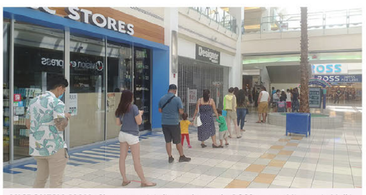
MICRONESIA MALL: Shoppers wait in line to shop at the ROSS store at Micronesia Mall in Dededo on Sunday, May 24.